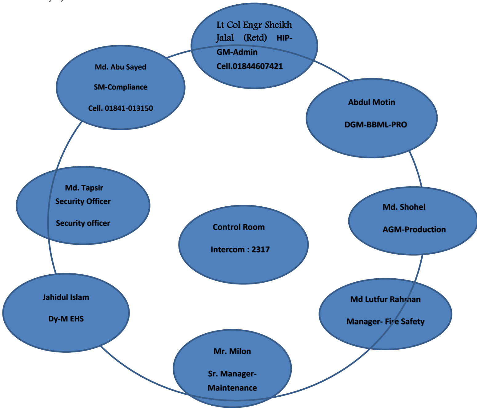
Fig: Emergency response team for BBML-HIP operational site

First Aid Team: The member of the first aid team is fully dedicated to handle any type of personal injury / accident.